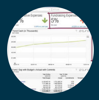
Product Introduction Video Sage Intacct for Nonprofits Overview